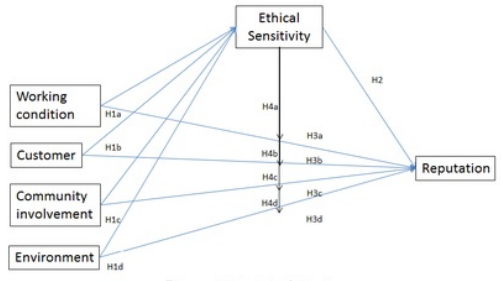
Figure 1 Model of Study

H4d: The effect of CSR in term of environment on SME's reputation is higher for better SME's owner ethical sensitivity than their counterparts